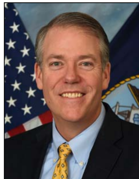
Secretary of Defense Lloyd Austin James III

In this position, he also served as the Acting Principal Deputy Assistant Secretary for Management at the VA, and as