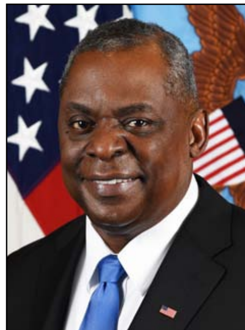
Secretary of Defense Lloyd Austin James III

After a tour as the Army's Vice Chief of Staff, Austin concluded his uniformed service as the commander, U.S. Central Command, responsible for all military operations in the Middle East and Afghanistan. In this assignment, he led U.S. and coalition efforts to battle ISIS in Iraq and Syria. He retired from the Army in April, 2016.